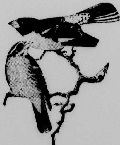
INSECT DESTROYERS GUARANTEED BY UNCLE SAM.

examinations. On the contrary, they do much good. They feed on locusts, periodical cicada, the Colorado potato beetle, the rose chafer, cotton worm,