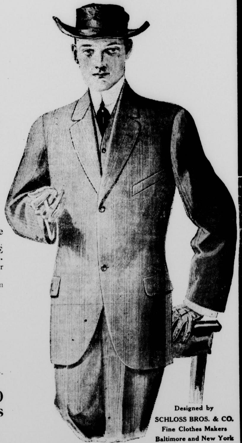
Designed by SCHLOSS BROS. & CO. Fine Clothes Makers Baltimore and New York

You will be surprised what $15.00 will do and from there on upwards we have No Competitors