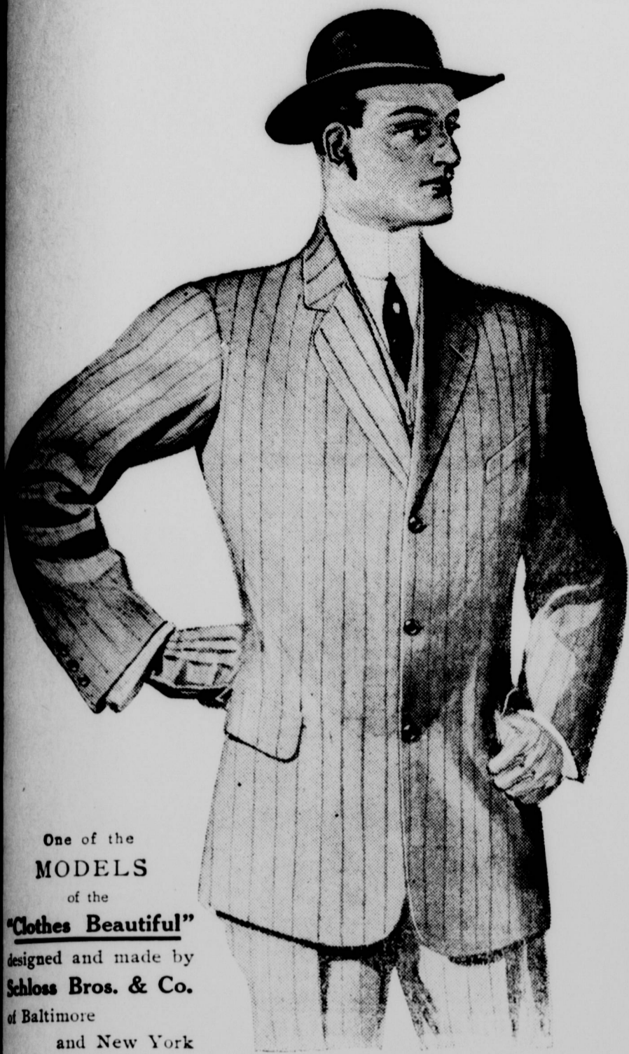
One of the MODELS of the "Clothes Beautiful" designed and made by Schloss Bros. & Co. of Baltimore and New York

We are ready to show you the New Fall Models from the famous Master Tailors